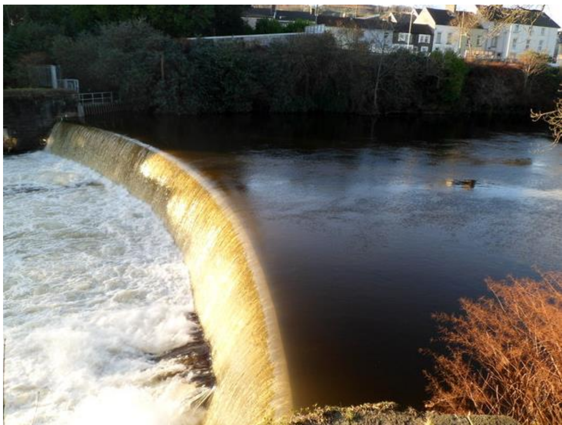
Fig' 02 – Illustration as it stands