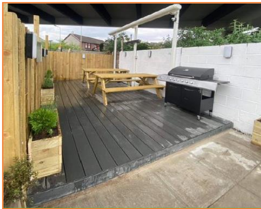
The Rheola, Porth